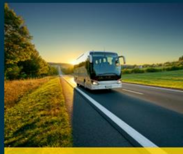
PASSENGER CARRYING VEHICLE (PCV)