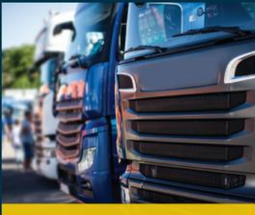
HEAVY GOODS VEHICLE (HGV)

Mission Zero is relevant to all vehicles types and sizes that are driven on the road.